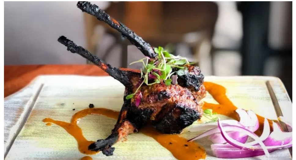
Khan Saab Desi Craft Kitchen - Michelin Bib Gourmand recipient