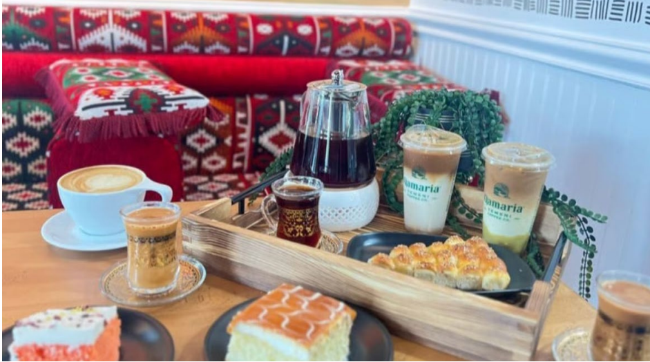
Qamaria Yemeni Coffee Co.

Pinnacle at Fullerton's ground floor tenants include Kosha 5 Yoga, Tennis Factory, Qamaria Coffee and Khan Saab