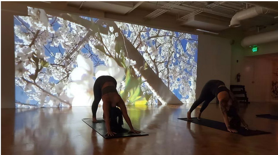
Kosha 5 Yoga Studio